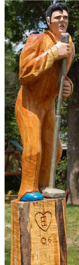
Elvis sings about his blue suede shoes, behind 424 Shawnee in Tonganoxie, KS